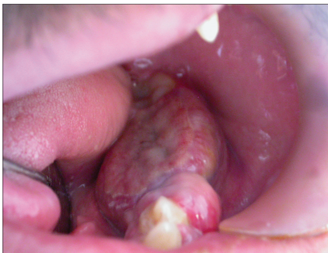
Figure 1. Photograph of the oral cavity showing swelling of left mandibular region

An incisional biopsy was performed under local anesthesia. The specimen included the incisors, molars, and a margin of uninvolved tissue. Histologically, multinuclear giant cells and stromal cells typical for giant cell granuloma were seen. According to these features, the histopathological diagnosis was "giant cell granuloma". Laboratory examination revealed elevated serum calcium, and the patient was referred to endocrinology outpatient clinic for further investigation of hypercalcemia with a preliminary diagnosis of brown tumors secondary to hyperparathyroidism.