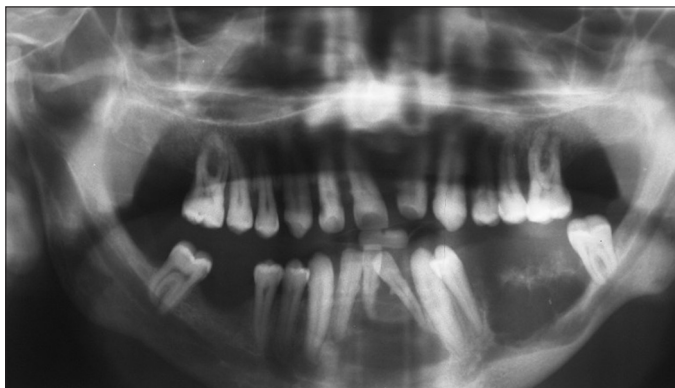
Figure 2. Panoramic radiograph of the jaw showing a radiolucent lesion extending from the left mandibular molar area to the right anterior mandible

On admission, the patient complaints of nausea and vomiting. Physical examination was unremarkable except for swelling noted on his left mandibular region. Complete blood count, and renal and liver function tests were within normal limits. Serum calcium and phosphorus levels were 3.4 mmol/L and 0.6 (0.7-1.5) mmol/L, respectively. Twenty-four hour urinary calcium excretion was 348 (12.5-75) mmol/day. Serum intact parathormone level was high; 487.3 (11-79) ng/L.